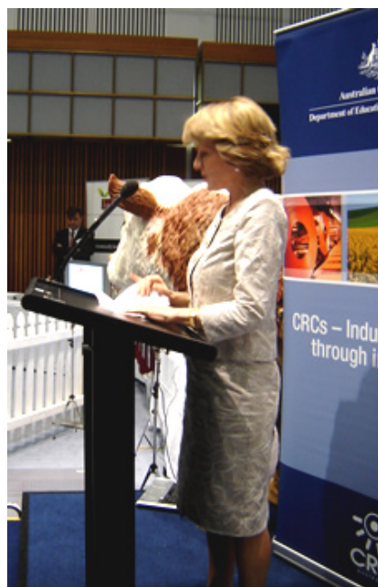
Above: The Hon Julie Bishop , Minister for Education, Science and Training at the CRC Showcase event.

5 December 2006, Parliament House, Canberra